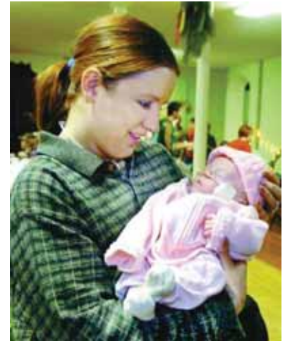
Mother and child at “Jacob’s Christmas,” December 25, 2006

The Express-Times newspaper of Easton recognized the event with one of its trophies for community service. Equally rewarding, we had volunteers come from as far as San Francisco to participate, having almost as many volunteers as guests. All of this was accomplished despite the fact that a number of people said no one would volunteer and no one would show up. Almost sounds like a startup company, doesn’t it?