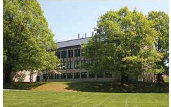
In summer 2007, Thor Power will move into the new BF TechVentures building in Bethlehem, PA.

Alternating current (AC) motors are used extensively in many products, including refrigerators, air conditioners, power tools, washers, dryers and computers. The basic design, perfected in the late 1800s, involves supplying an external stator with an electrical current to produce a rotating magnetic field. This electromagnetic field spins the rotor that rests inside the stator. Such a design is only 47 percent efficient in its use of electricity.