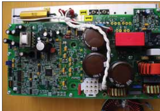
Microelectronics, 100 to 267 VAC; 50/60 Hz